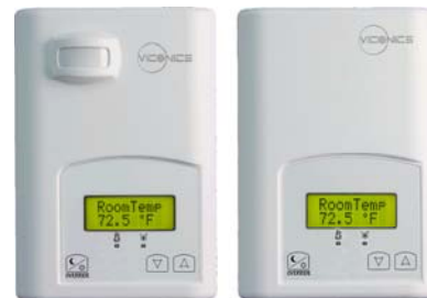
Fig.1 - VT7200 Series

Typical applications include local hydronic reheat valve control and pressure dependent VAV with or without local reheat. The product features a backlit LCD display with dedicated function menu keys for simple operation. Accurate temperature control is achieved due to the product's PI proportional control algorithm, which virtually eliminates temperature offset associated with traditional, differential-based thermostats. Models are available for 3 point floating and analog 0 to 10 Vdc control. In addition remote room sensing is available.